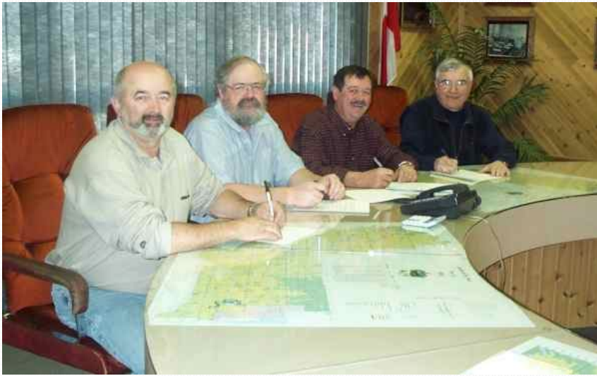
RRTS Original Lease signing – St Paul