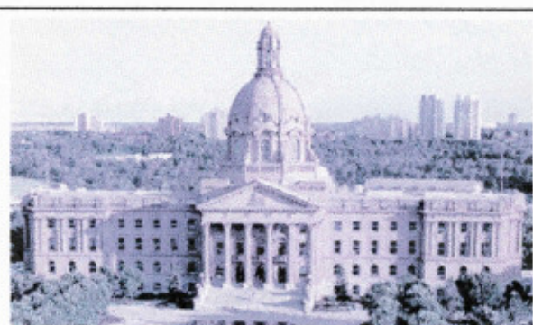
Alberta Legislature, Edmonton

Happy Birthday, Alberta & Saskatchewan !!!