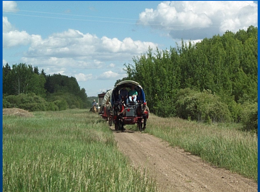
Iron Horse Trail near Lindbergh